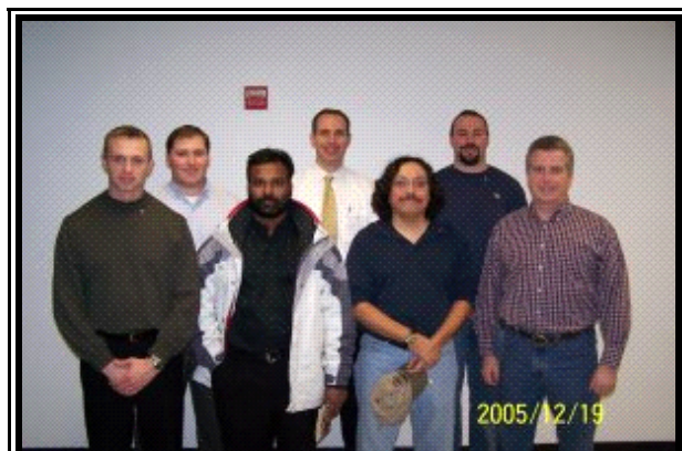
Council 7909 First Degree New Members (December)