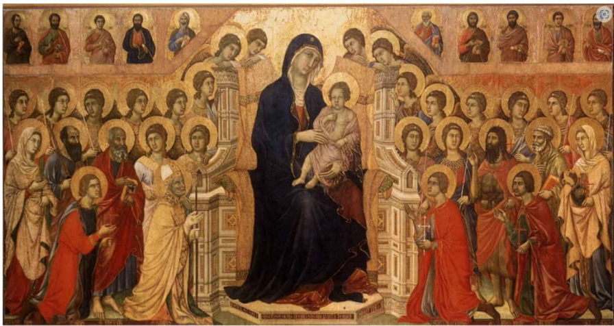
Catholic Saints A-Z