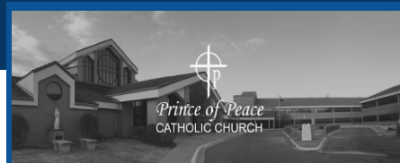
Prince of Peace CATHOLIC CHURCH

See the web site for the latest information and newsletter: www.kofc2260assemble.org