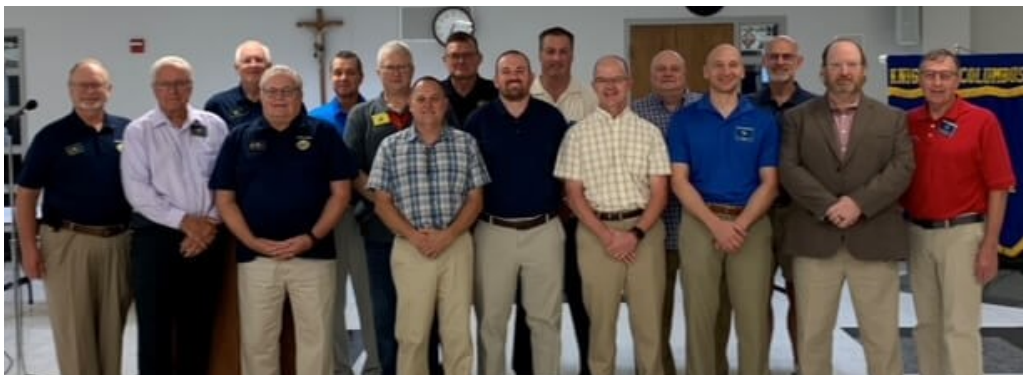
Officers from all three councils.