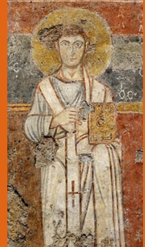
No 6. Alexander I (AD 109 – AD 119)

The introduction of the customs of using blessed water mixed with salt for the purification of Christian homes from evil influences, as well as that of mixing water with the sacramental wine, are attributed to Pope Alexander I. Some sources consider these attributions unlikely. It is certainly possible, however, that Alexander played an important part in the early development of the Church of Rome's emerging liturgical and administrative traditions. *