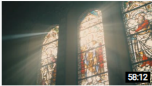
St Joseph Our Spiritual Father - Full Documentary

St. Joseph: Our Spiritual Father provides viewers with a glimpse into one of the most incredible lives in all of human history – a figure whose spiritual fatherhood remains open to all of us.